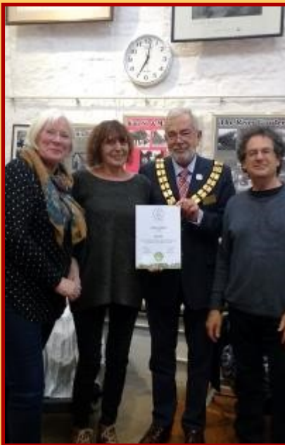
In Bloom Award for Belper