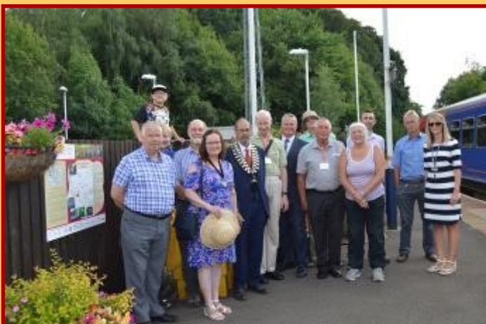
Launch of Pentrich Revolution Bicentenary Panel