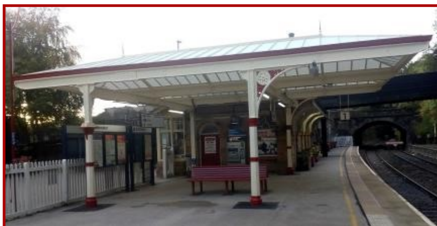
Matlock Station canopy restored

The station platform environment continues to be cared for to a high standard by the Station Adopters. They are assisted with supply of water by Peak Rail enabling them to maintain impressive floral displays in their numerous planting tubs.