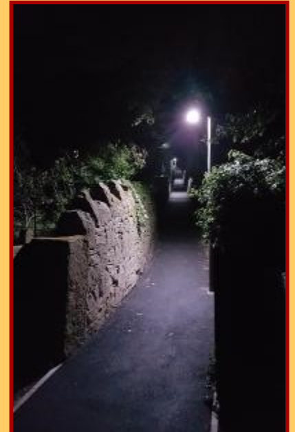
Whatstandwell Access Improvements