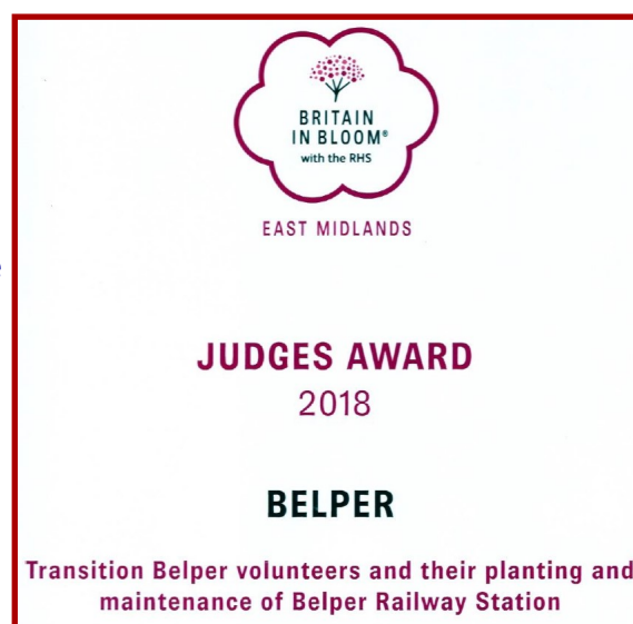
RHS In Bloom Judges Award

The volunteers continued to meet up every Sunday morning throughout the spring, summer and autumn to care for the extensive station garden areas including the wildlife meadow and adjacent footpath areas. In May, the volunteers also shared a stall with Derbyshire Wildlife Trust at the Belper Goes Green festival and using natural materials, they helped children make mini-insect homes to take home, whilst also promoting their station gardening activities and achievements.