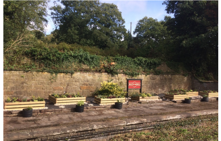
Landscaping enhancements to the disused platform at Whatstandwell Station

The project took place over two days, with Network Rail's Asset Team having a team building day working with East Midlands Trains staff to build the planters and prepare the area. This was followed by a community action day with staff from East Midlands Trains and Network Rail to carry out the planting. The Station Adopters were also assisted in extending part of their shrub garden behind the main platform. ACoRP provided Small Grant Funding towards the improvements.