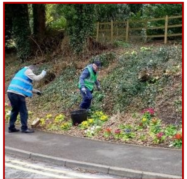
Adopters maintaining Cromford Station

During the Derby Resignalling project, a project action day was organised during the line closure to undertake various maintenance work including cleaning the footbridge and cut back of vegetation. Network Rail also carried out significant platform improvements including resurfacing and improvements to the platform edge.