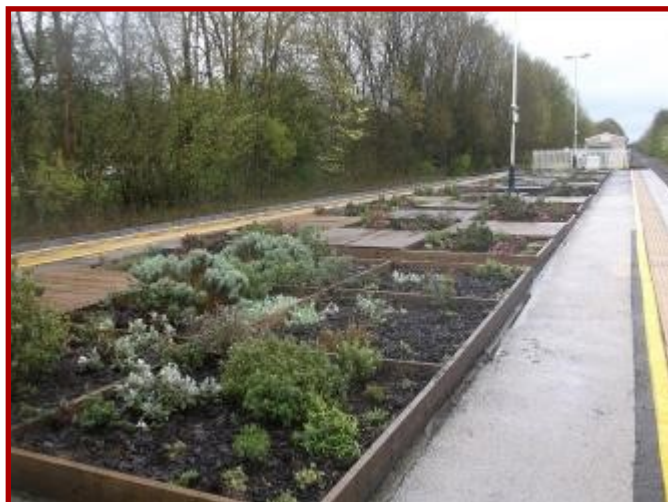
The extensive station garden area at Duffield

Over the last two years, the large, formerly barren platform has been transformed by the completed station decking and planting feature that now comprises over 30 planters. The planters have a typically Mediterranean feel as shrubs and herbs have been selected that will flourish in a minimal depth of soil. The project was shortlisted at the Community Rail Awards 2018 in the 'Most Enhanced Station Buildings and Surroundings' category.