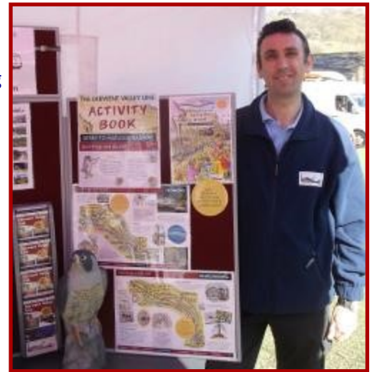
Promoting the soon to be completed Activity Book at the DerwentWISE Celebration event at Cromford Canal

In March, the community rail partnership and volunteers from Cromford Station attended the DerwentWISE Celebration event at which the soon to be launched Activity Book, was promoted as part of the display.