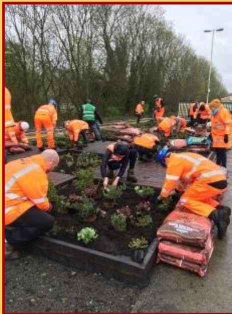
Duffield Station Garden completed