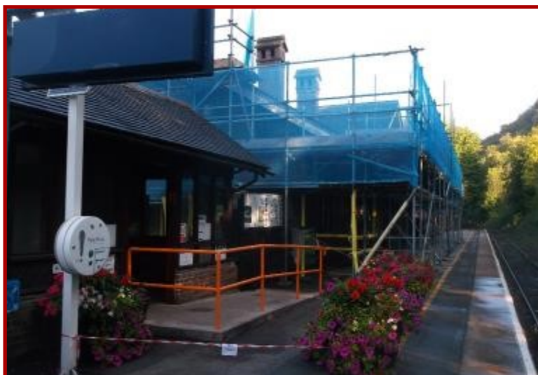
Whistlestop Café during and after renovation

On the station platform, the Station Adopters, installed eight new 'self-watering' planters. These have proved to be a great success due to the self-contained water reservoir making them easier to maintain and enabling the flowers to flourish. Funding gained last year from ACoRP by the Community Rail Partnership had funded these planting barrels.