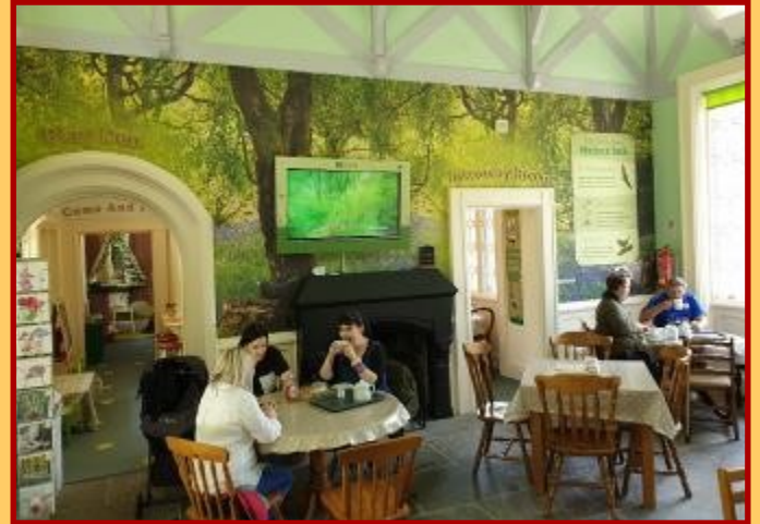
Whistlestop Café opens at Matlock Bath Station