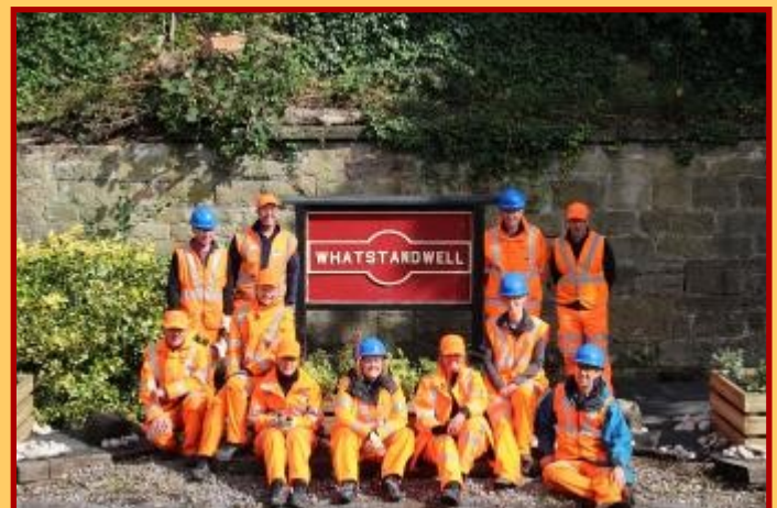
Whatstandwell Station Landscaping